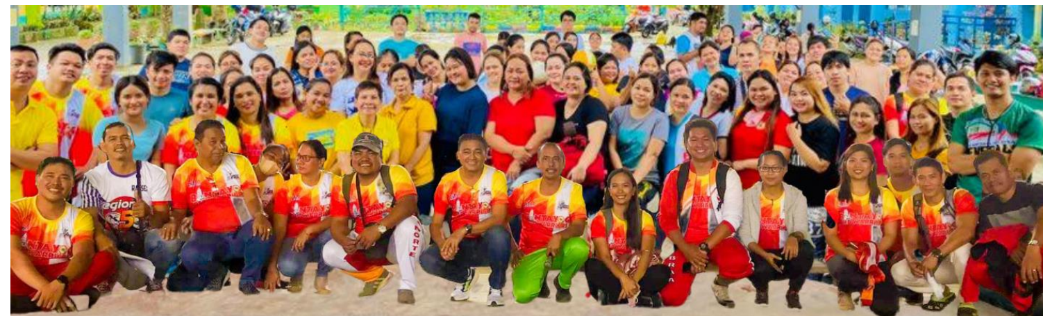
BACK AND STRONGER. SDO Camarines Norte Coaches and Officiating are back on the playing field to gear up for the forthcoming Palarong Bicol and Palarong Pambansa this school year.

The training on sports features discussions and lectures on different sports that included Archery, Arnis, Athletics Badminton, Baseball, Basketball, Billard, Boxing, Chess, Dance Sports, Football Futsal, Gymnastics, Pencak Silat, Sepak Takraw, Soft Ball, Swimming, Table Tennis, Taekwondo, Tennis, Volleyball, Weight Lifting Wrestling and Wushu Sanda as said training got them ready back on the field, court or pitch in the coming Palarong Panlalawigan confirmed thru Division memorandum No. 017, s. 2023 held at Esmeraldo T. Eco Athletic Field on February 10-12, 2023.