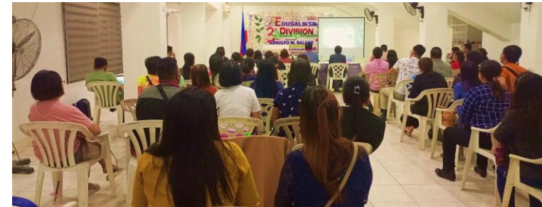
CULTIVATING RESEARCH. SDO Camarines Norte's culture of research is alive with the conduct of the 3 rd Edusaliksik Research Colloquium attended by research enthusiasts of the division.