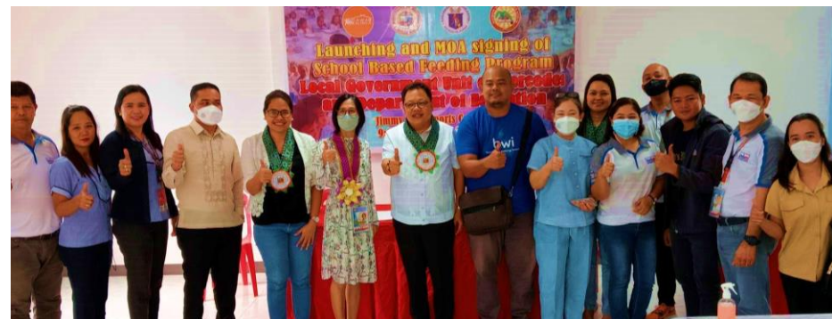
THUMBS UP. LGU Mercedes, Gawad Kalinga Foundation and SDO Camarines Norte are united to battle short term hunger in schools through School-based Feeding Programs.

Long before the launching, the feeding program started on January 17 and is continuously providing nutrition to the 686 learner-beneficiaries of Mercedes ES, Tagontong ES and San Roque ES with hot meals prepared in the Central Kitchen and later delivered to the learners of the identified schools with funds for the purpose provided by Mercedes LGU and shall continue for a total of 120 days.