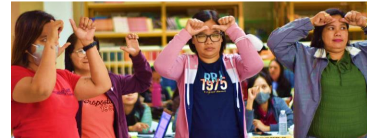
INCLUSIVE. SDO Camarines Norte advocacy for inclusive education is even strengthened as it trains SPED and receiving teachers with Filipino Sign Language.

Forty-five (45) SPED teachers and receiving teachers completed the training sessions on Filipino Sign Language on January 14, 21, & 28, 2023 at the DepEd Library Hub, an activity in line with Division Memorandum No.003 s. 2022 and Republic Act 10533 or the Enhanced Basic Education Act of 2013 which states the inclusiveness of enhanced basic education and aimed to recapitate and demonstrate understanding of Filipino Sign Language which they will use in handling hearing-impaired learners.