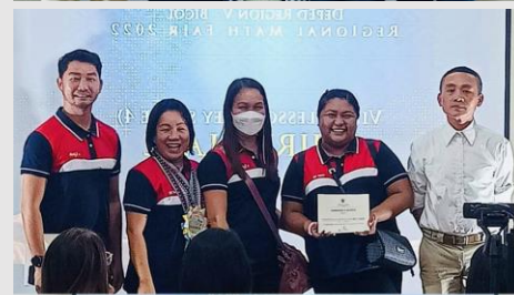
PROUD MOMENT. The delegation of SDO Camarines Norte brought home the bacon as they brought various awards from the recently concluded 2022 Regional Math Fair held on January 21-22 at Legazpi City, Albay.